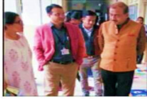
Dignitaries present during 'rangoli' competition.