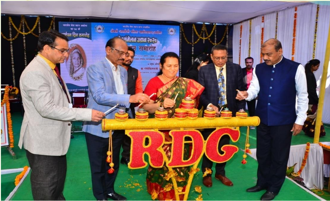
Inauguration of Gathering “Uddan – 2020” by Honourable Neelam Gorhe & other in-house dignitaries.