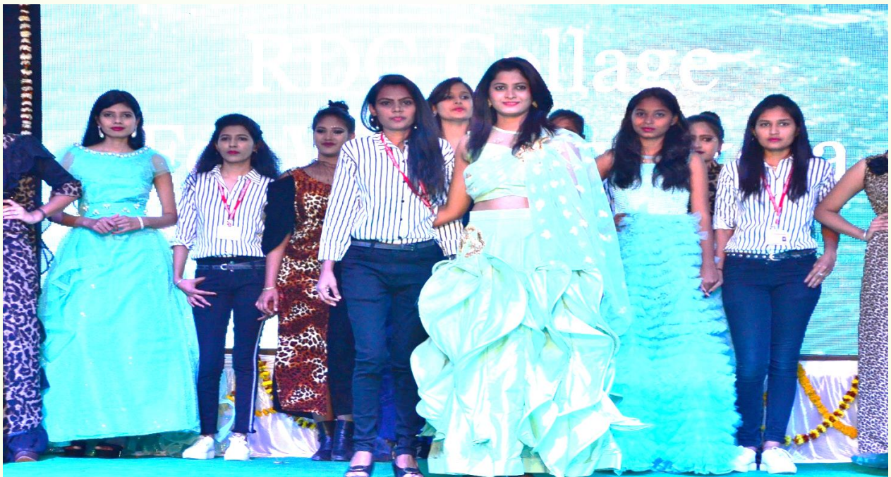
Outstanding Alumni Guest – Actress Pratiksha Desmukh as a show stopper, along with other model students, in a Fashion Show.